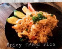
Spicy fried rice

PAD THAI (V, GTF) Famous stir fried thin rice noodle with egg, shallots, bean sprouts served with crushed peanut.