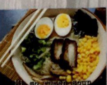
Mi so ramen soup

MI SO RAMEN SOUP 14 Ramen noodle in Japaneses soy bean based soup with crispy pork belly ,corn, seaweed and boiled egg.