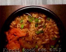
Kimchi kook soo soup

BEEF NOODLE SOUP 14 Vietnamese beef soup (PHO BO) with thin rice noodle and sliced beef.