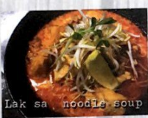
Lak sa noodle soup

LAK SA NOODLE SOUP M.Spicy Malaysian laksa soup with vermicelli noodle, tofu and vegetables.