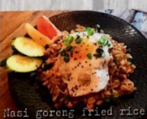
Nasi goreng fried rice

SINGAPORE NOODLE Stir fried vermicelli noodle with yellow curry powder, egg and vegetables.